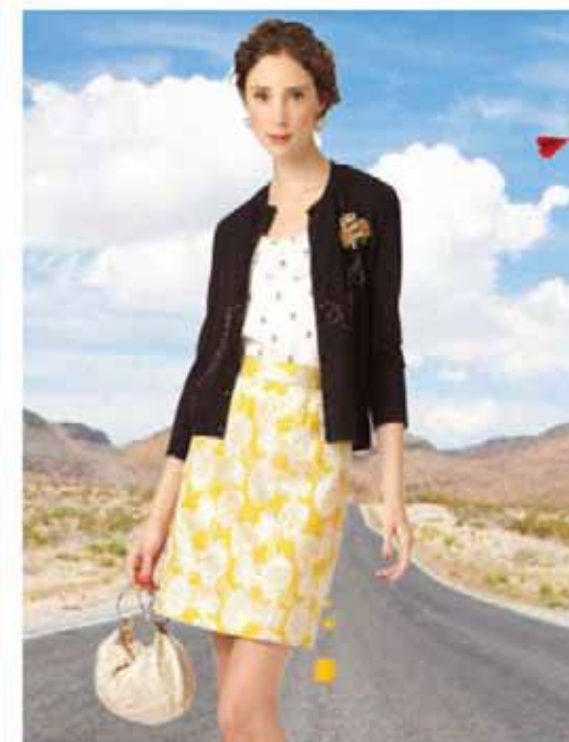
antiqued in pomona, lunched in lake arrowhead