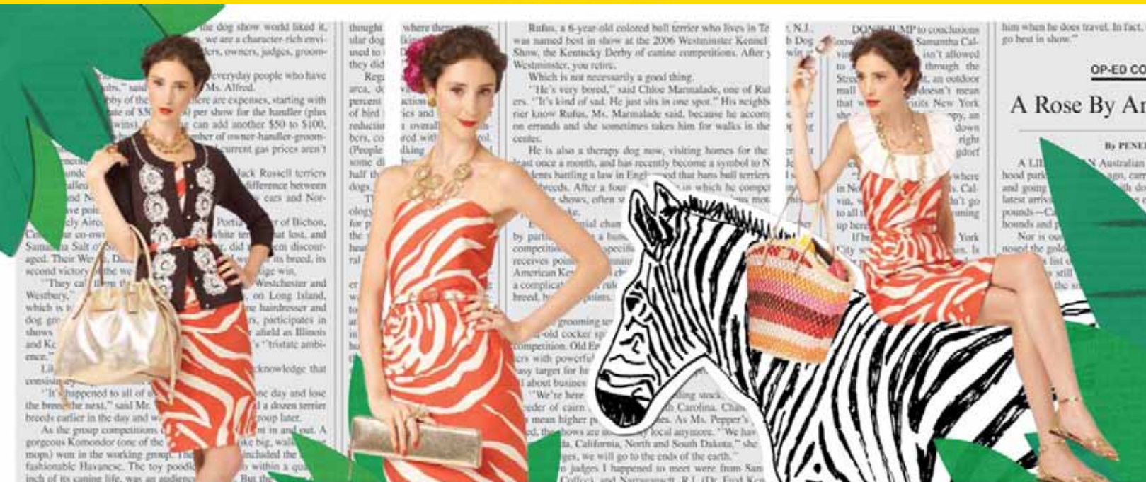
braved the urban jungle en route to dinner