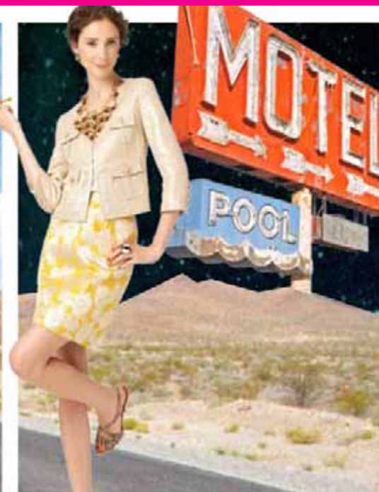
beat the bartender at a game of darts