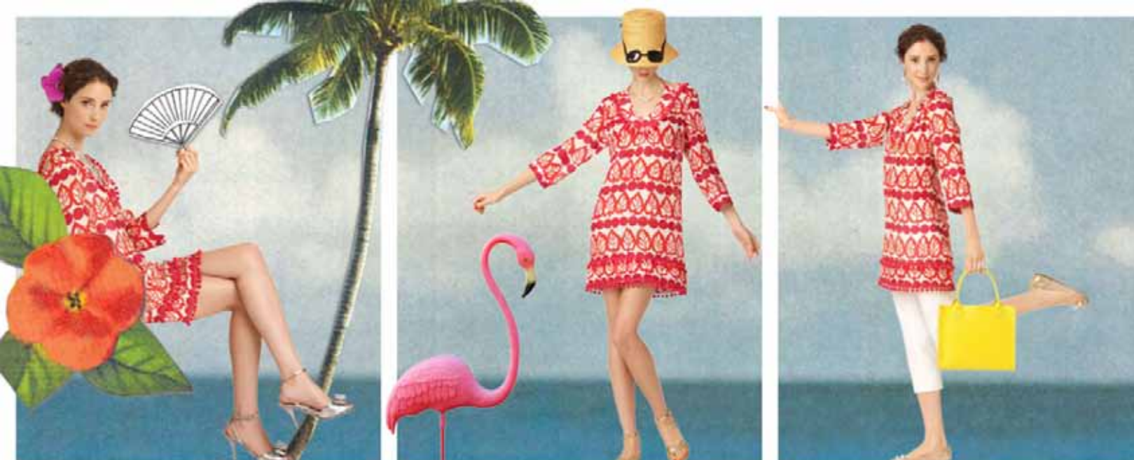
found the flora a complement to her cocktail attire